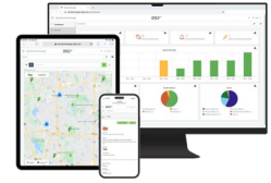
Manage and configure Digi IX10 with Digi Remote Manager